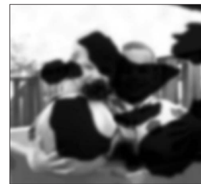
Same scene viewed by a person with diabetic retinopathy